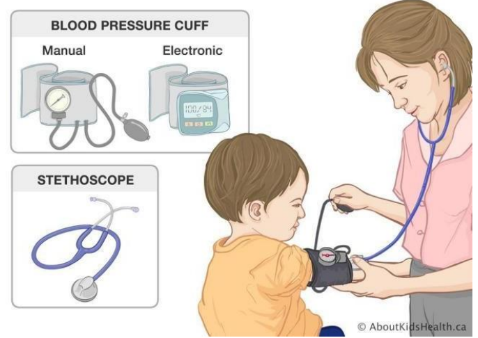
Fig 2: Cuff chart for proper positioning and determination of pulse sleeve in kids

The BMI category. NML stands for normotensive; HTN stands for hypertensive