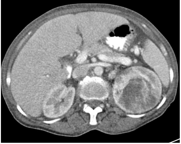
Figure 3: Axial contrast-enhanced computed tomography scan of a 61-year-old female patient with retroperitoneal renal cell carcinoma well-defined enhancing solid-cystic lesion with central areas of necrosis is seen in left kidney arising from the upper pole. The lesion shows heterogeneous enhancement of the cystic part and homogenous enhancement of the solid area