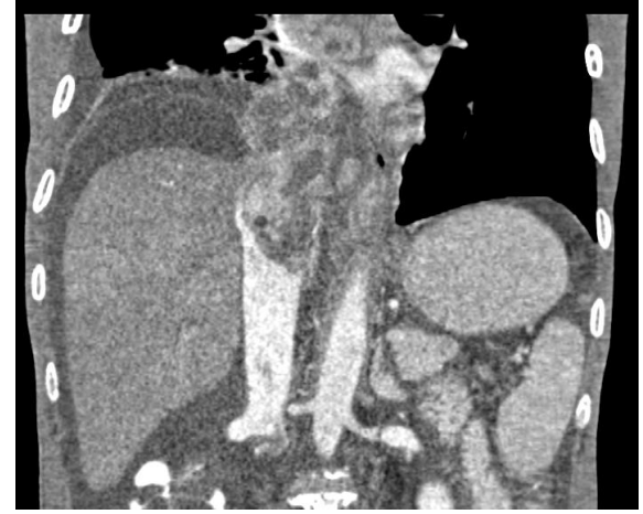
Figure 4: Contrast enhanced computed tomography scan of a 59-year-old male patient with retroperitoneal IVC leiomyosarcoma, an ill-defined heterogeneously enhancing filling defect in the IVC. The wall of IVC is imperceptible

In our present study, the 2nd most common mesodermal neoplasm was liposarcoma, forming 22.22%. Liposarcoma showed thick, irregular, and nodular septa. On post contrast study, they showed enhancement. These features help in differentiating it from lipoma. This is consistent with the study done by Rajiah et al. , [17].