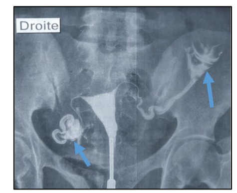
Figure 1: HSG face image in the repletion phase: normal hysterosalpingography with bilateral tubal permeability and peritoneal mixing of contrast (arrows)