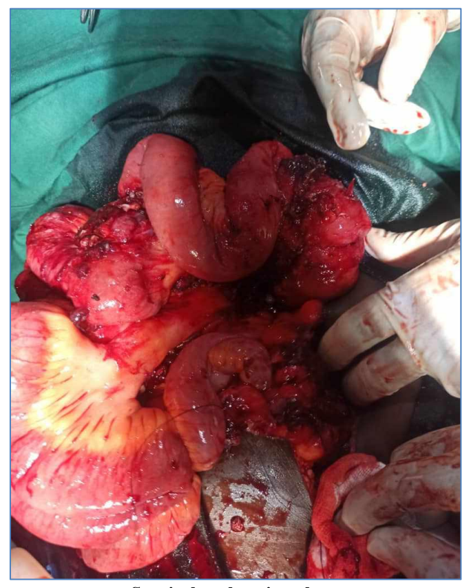
Surgical exploration phase

Antibiotic and analgesic therapy, A diet until transit resumes, Intraoperative drainage performed in all patients.