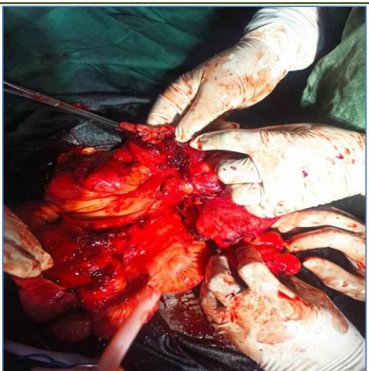
Discovery of the appendix