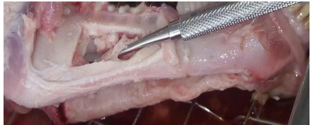
Figure 2: Bone harvest using a piezotome from a sheep mandible showing the nerve above the instrument