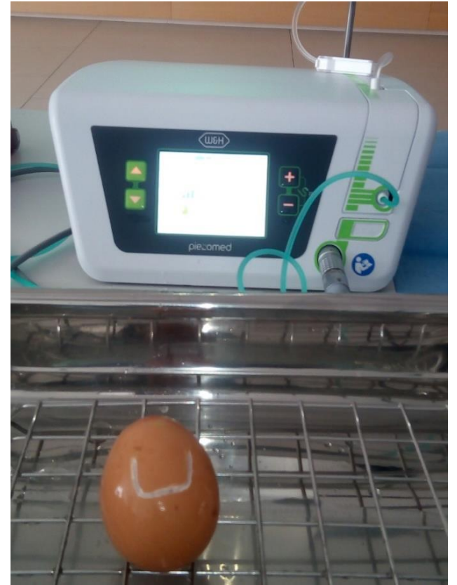
Figure 4: Section performed on the eggshell by ultrasound microvibration emitted by the piezoelectric device shown in the photo