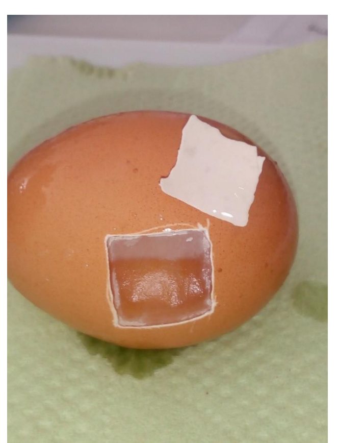
Figure 5: Result of the advanced simulation achieving the egg membrane undermining from the eggshell fragment