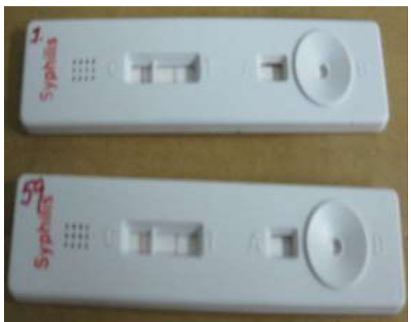
Fig. 2: Treponema Pallidum Haemaglutination Assay