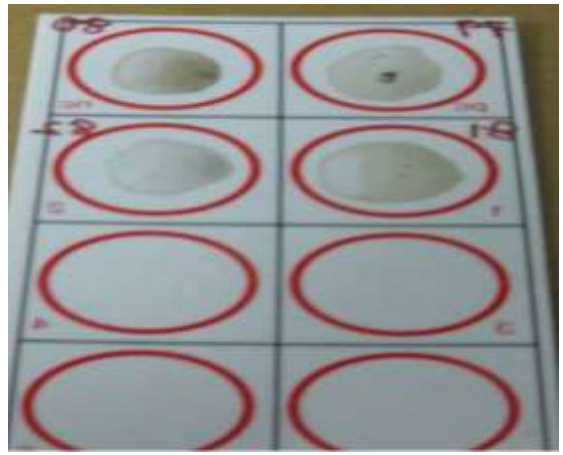
Fig. 1: Rapid Plasma Reagin Test