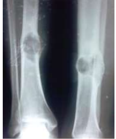
Fig. 1: Osteolytic lesion in the diaphysis of tibia 2 years back

aetiology. The histopathology show islands of epithelial cells in a fibrous stroma and Immunohistochemistry examination show- the neoplastic cells are focal CK and EMA positive and negative for CD34 and CD31. The features are consistent with adamantinoma right tibia. We evaluated for the secondaries with C.T scan of thorax plain and contrast, which was normal (Fig 4, 5). Bone scan which was positive only for the right tibia and final diagnosis of adamantinoma of right tibia with extra compartmental involvement was made. Patient was treated by above knee amputation, as limb salvage will be having high recurrence rate in our case.