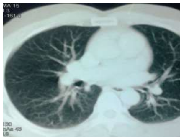
Fig. 4: CT thorax normal