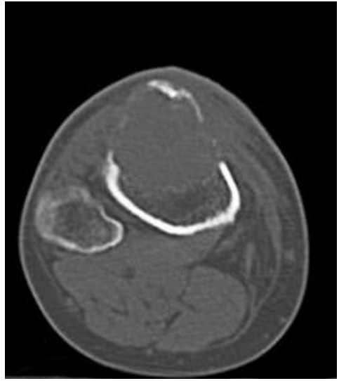
Fig. 6: CT showing breach in the cortical continuity