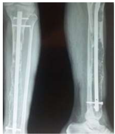
Fig. 2: Adamantinoma involving the entire tibia with nail insitu