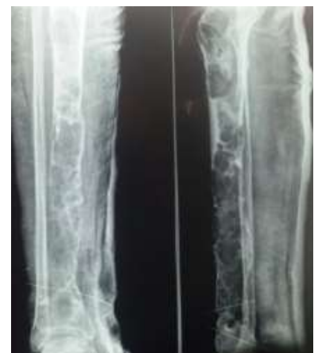
Fig. 3: Adamantinoma of tibia after nail extraction