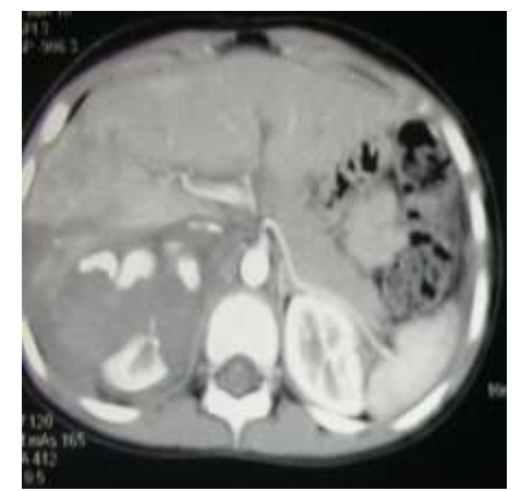
Fig. 3: CT scan showing liver and left renal injury