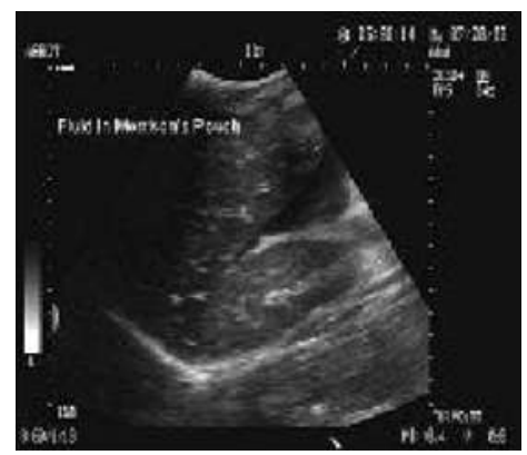
Fig. 2b: USG showing haemoperitoneum