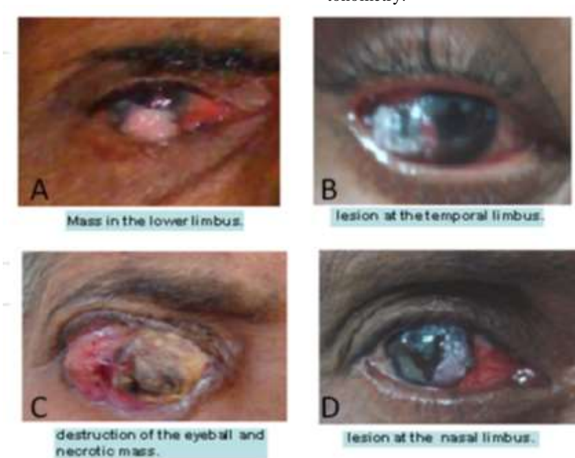
Fig.1:A.mass in lower limbus, B. Lesion at temporal limbus, C. destruction of eye balland necrotic mass, D. Lesion at nasal limbus

The study was conducted at Department of Pathology Sarojini Devi Eye Hospital (SDEH), Hyderabad between June 2008 and May 2013. The study included 170 specimens from 168 patients. All patients with clinical suspicion of OSSN who presented to the Department of Oculoplastics SDEH, during this period were included in the study (Fig.1). Detailed history including age, sex, site of lesion, risk factors & HIV status was taken from all these patients. Best corrected visual acuity was recorded. Slit lamp examination, Fundus examination and gonioscopy was performed. Intraocular pressure was measured by applanation tonometry.