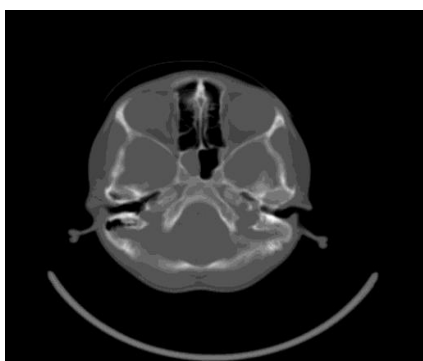
Fig. 3: CT scan showing: Right isolated sphenoid sinus opacification