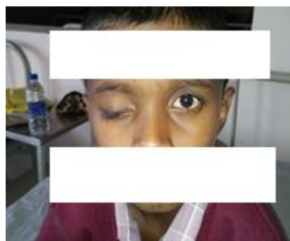
Fig. 1: Patient showing right sided ptosis