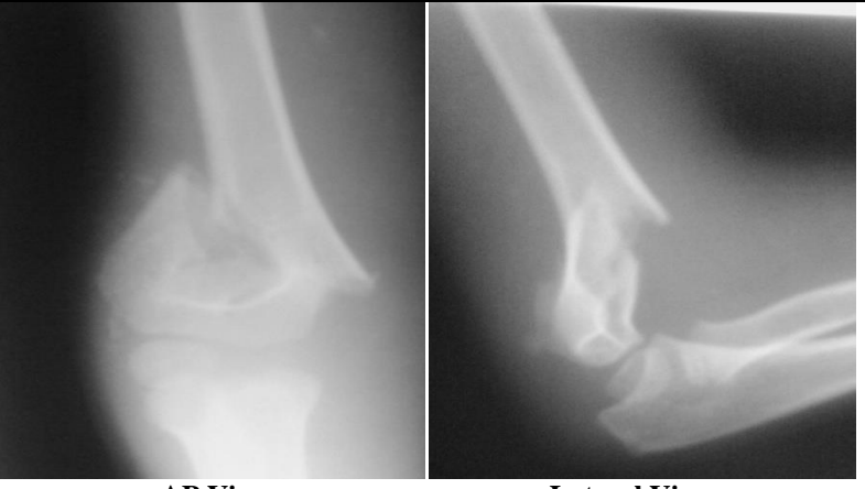
AP View Lateral View Fig. 1: Pre Operative X- Ray of French Type 5 Fracture

Chaitanya PR et al., Sch. J. App. Med. Sci., 2014; 2(3A):899-902