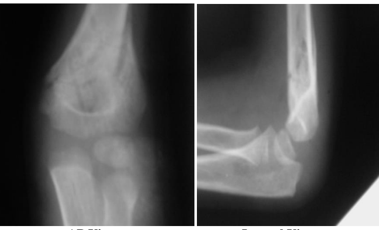
AP View Lateral View Fig. 3: X-Rays after 6 Weeks of Follow Up