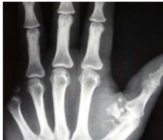
Fig. 1: X-ray showing soft tissue mass with calcification

Gross examination revealed well defined mass of 2x2 cm. Cut section showed a firm, whitish tumor with gelatinous and chalky white areas of calcification.