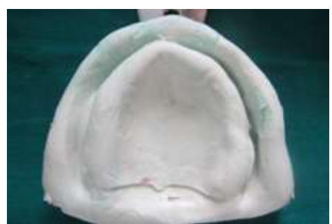
Fig. 5: Putty Index of Tissue Surface of Upper Denture