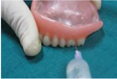
Fig. 7: Injection of Glycerine in Prosthesis