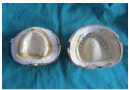
Fig. 2: 1.5 mm Thick Polyethylene Sheet Vaccum Adapted Over the Master Cast