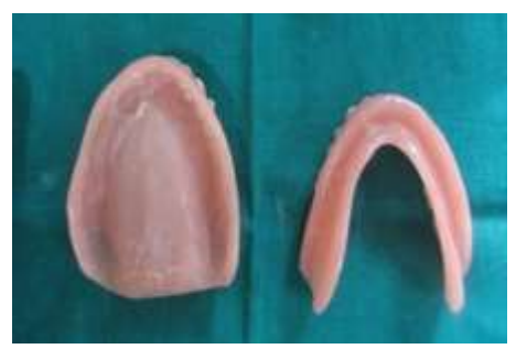
Fig. 3: 1.5 mm Thick Polyethylene Sheet Incorporated in the Upper Denture