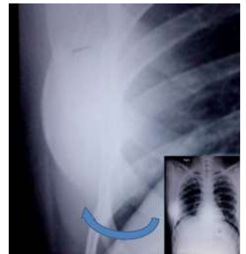
Fig.2: Chest radiograph (inset image) revealed well defined, soft tissue shadow over right chest wall with absence of calcification.

Fig.1: Right breast lump underlying nipple areola complex (Fig.1A); Well circumscribed, spherical breast swelling with shiny and stretched areola along with retraction of nipple is seen from the side (Fig.1B).