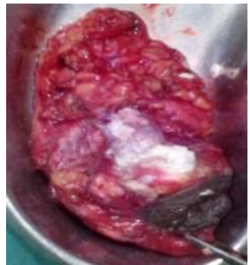
Fig.3: Excised specimen showing epidermoid cyst with white cheesy material, nipple along with portion of areola is seen at one end, and densely adherent surrounding fat at the other end.