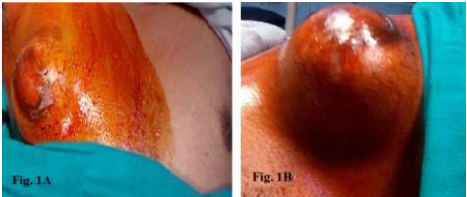
Fig.1: Right breast lump underlying nipple areola complex (Fig.1A); Well circumscribed, spherical breast swelling with shiny and stretched areola along with retraction of nipple is seen from the side (Fig.1B).