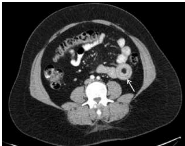
Fig. 1: Intussusception due to lipoma in Meckel's diverticulum (Abdominal Computed tomography)