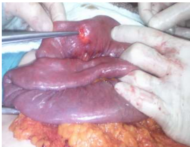
Fig. 2: Lipoma in Meckel's diverticulum