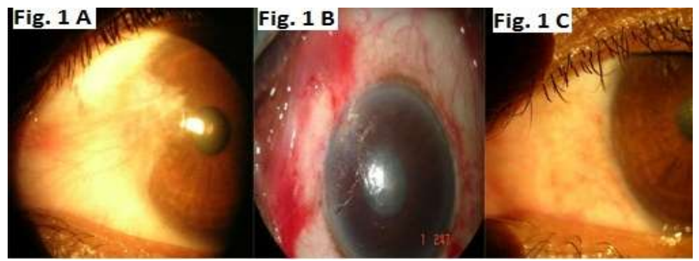
Fig. 1: (A) grade 2 primary nasal pterygium; (B) Fibrin glue used to fix Conjunctival autograft; (C) Post operative picture after 1 month