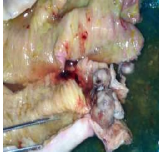
Fig. 3: Concomitant polyp in the proximal jejunum