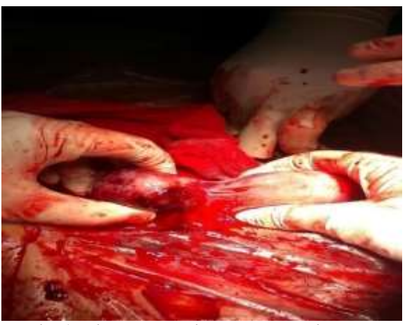
Fig. 1: Right ovary with hemmorhagic mass

But in this case all the four criteria's could not be full filled creating a diagnostic dilemma of ovarian pregnancy versus ectopic in tubal remnant involving the ovary. To prevent recurrent ectopics, if the woman has completed her family and has a history of ectopic pregnancy, effective contraception counselling may be given, or permanent contraceptive measures implemented.