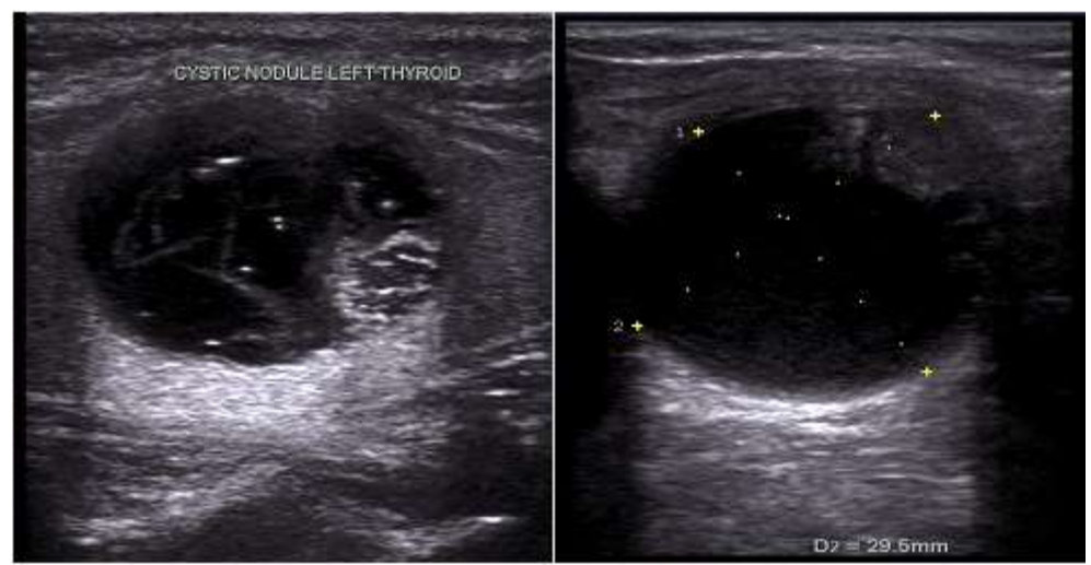
Fig. 4: USG image shows a well defined predominant solid cystic benign lesion with multiple septations