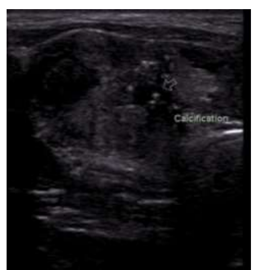
Fig. 1: Calcifications and heterogenous hypoechoic lesion: Longitudinal USG image showing multiple punctate echogenic shadows (arrow) i.e. micro calcifications in a hypoechoic ill defined nodules suggesting malignant lesion