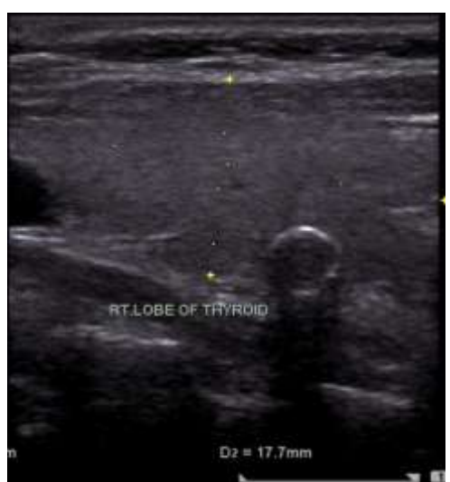
Fig. 2: Transverse USG image shows a solitary peripheral curvilinear calcification with distal shadowing in a benign oval nodule

Fig. 1: Calcifications and heterogenous hypoechoic lesion: Longitudinal USG image showing multiple punctate echogenic shadows (arrow) i.e. micro calcifications in a hypoechoic ill defined nodules suggesting malignant lesion