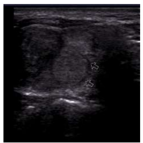
Fig. 3: USG image shows a well defined hyper echoic benign nodule with smooth peripheral halo