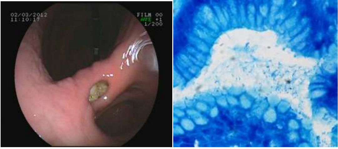
Fig. 1: Upper gastrointestinal endoscopys howing gastric ulcer & Microscopy showing H. pylori on giemsa staining.

Patient were kept nil by mouth six hours before the procedure. An uppergastro intestinal endoscopy was done and findings were noted (Fig. 1). Two biopsy specimenswere obtained from the antrum. Biopsy was also taken from any suspicious lesions, if noted. One biopsy specimen from the antrum was used for histopathological examination (Fig. 2) and the remaining biopsy specimen sent for rapid urease test (Fig. 3). Based on the rapid urease test and histopathological examination the incidence of H. pylori infection was determined. Subjects were considered to be infected even if one of the two tests was positive.