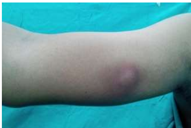
Fig. 1: Diffuse small lemon shaped swelling was seen over medial aspect of right mid arm

Patient was advised surgical excision which he declined. Patient was treated with Albendazole 400mg daily for 4 weeks and showed marked reduction in size of swelling and reduction of symptoms. The swelling totally disappeared after 2 months with only overlying hyper-pigmentation left.