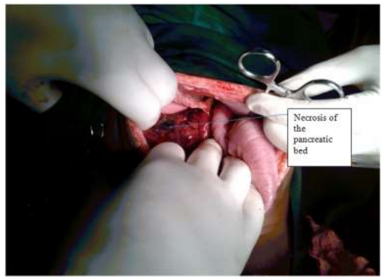
Fig. 1: Necrotic appearance of the pancreatic bed on inspection just after opening the abdomen