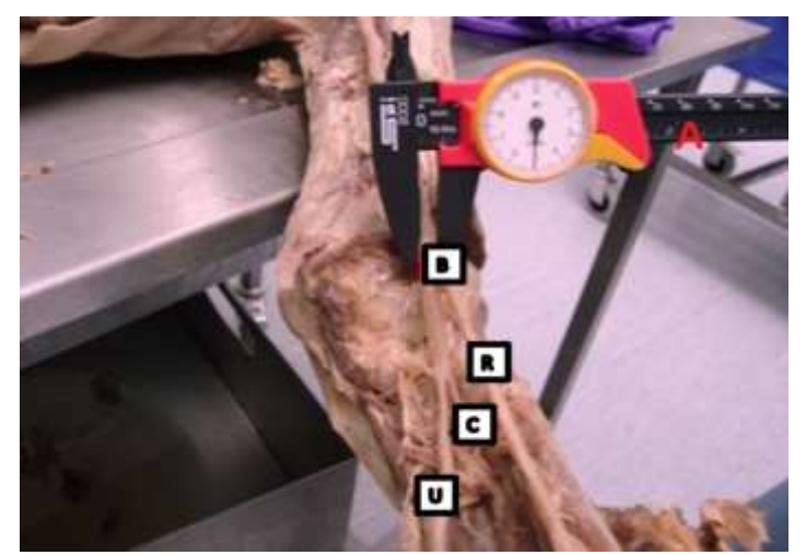
Fig. 1: The common interosseous artery is main branch the ulnar artery. B: Brachial artery, U: Ulnar artery, R: Radial artery, C: Common interosseous artery.

67.6% whereas it is congenital absence in 32.4%. The common interosseous artery presents in 50% whereas it is congenital absence in 50% in male and female. The origin distance of bifurcation of common interosseous from the ulnar artery origin is between 33.11 and 33.45 mm. The anterior and posterior interosseous artery presents in 98.5% and 92.9% whereas they are congenital absence in 1.5% and 7.1% respectively in total cases. Further, the anterior and posterior interosseous arteries present in 95% and 92.9% whereas they are congenital absence in 5% and 7.1% in male and female respectively. In investigation of the internal and external diameter of common, anterior and posterior interosseous arteries, there is a significant (p<0.05) difference between some male and female values as well as between the left and right sides (Table 1). In investigation of the mean, standard deviation and the range of values of the distance between the bifurcation of common interosseous artery and the origin of ulnar artery, the male distance is significantly (p<0.05) larger than the female value (Table 2).