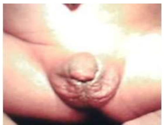
Fig. 2: A newborn baby girl (46 XX) with congenital adrenal hyperplasia due to 21 hydroxylase deficiency. Note: The fused labioscrotal folds and hypertrophy of clitoris

This report highlights and discusses the deficiency of steroid 21-\alpha -hydroxylase congenital adrenal hyperplasia in Saudi Arabia.