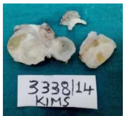
Fig. 1: Grey white tumor mass with area of myxoid changes

was performed, histopathologically diagnosed as 'Eccrine Syringofibroadenoma'. There is no other similar lesion elsewhere in the body or any of the family members. There is no history of systemic diseases like diabetes mellitus. Cutaneous examination revealed single, nodular, flesh-colored nodule associated with crusting. On gross examinations single greyish white firm tissue mass measuring 2.5 X 1.5 X 1 cm, cut section shows grey white irregular areas of tumor mass (Fig. 1).