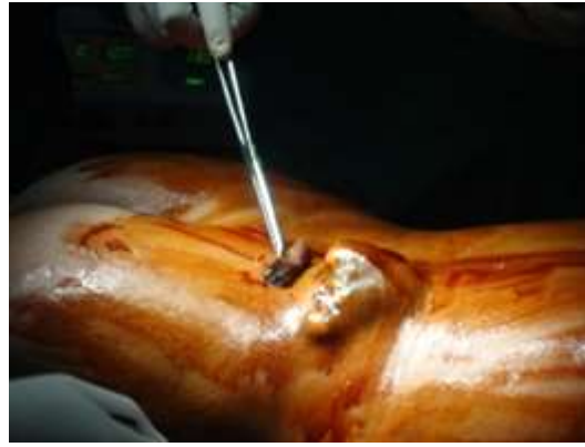
Fig. 1: Swelling on left lower back

A 60 year old male presented with a painless swelling measuring 15X10 cms on the left lower back since one and half year. The swelling had irregular surface, margins were well defined, firm in consistency, fixed to the overlying skin and non tender. FNAC revealed chondroid syringoma, biopsy for confirmation. The tumor was completely excised under spinal anesthesia. HPE showed chondroid syringoma. No recurrence of the tumor has been observed 12 months after surgery (Fig. 1 & 2).