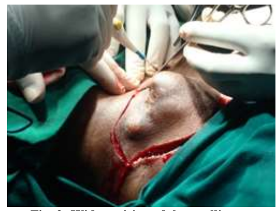
Fig. 2: Wide excision of the swelling