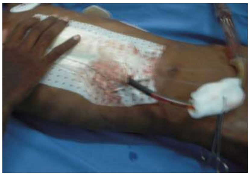
Fig-1: Showing Tube clamped after suspicious right ventricle perforation

A 13 years old teenager was admitted at Pediatric Center for pericarditis, pneumonia with fever and severe condition. A pericardial drainage was done with a tube using trocar technique. Quickly 500 ml of blood was drained. With this cardiac injury suspicion, the tube was clamped and the patient sent to our center (figure 1).