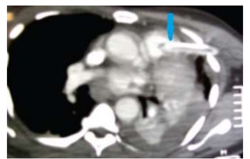
Fig-4: Showing CT scan image of tube in pulmonary artery perforation after chest drainage

He underwent surgery 3 hours after the accident. Over a sternotomy, with cardiopulmonary bypass, a 1 cm perforation of the pulmonary artery trunk was found (figure 5), with big hemothorax. The