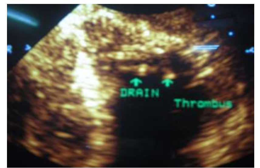
Fig-2: Showing Duplex scan image of tube and thrombus in right ventricle injury

clot on the tip (figure 2).The pericardium was thick, dense with massive pericardial effusion.