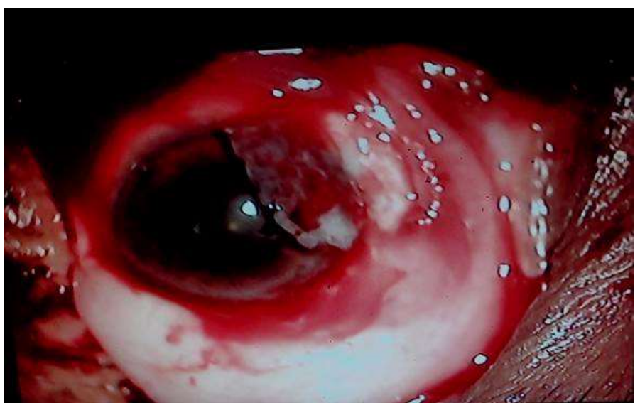
Fig 3: Bare Sclera and placement of Limbal Conj. Auto graft at Nasal Limbus