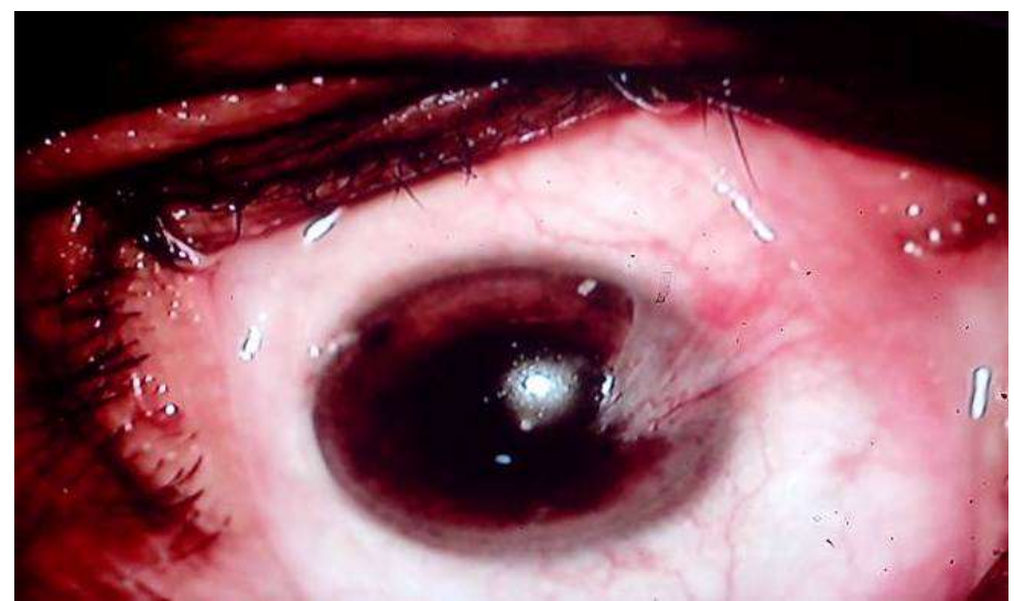
Fig 1: Pre-op Nasal Pterygium