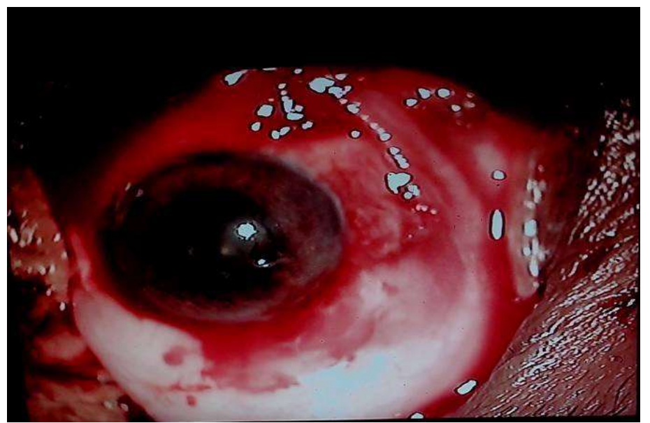
Fig 4: Placement of Limbal Conj. Auto garft At Bare-Sclera without any Suture or Glue