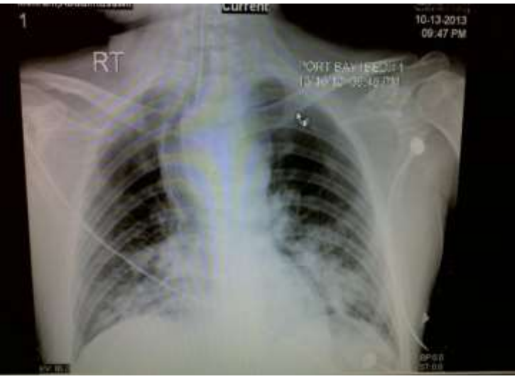
Fig 4: ET TUBE just above the tracheal stent

Patient was taken to the operation theatre. 10% lignocaine spray was in into the pharynx three times and we asked the patient to keep it in the mouth and to gargle, and not swallow. All routine monitoring were applied. Difficult intubation cart was kept ready. The Portex endo tracheal tube was loaded on to the well-lubricated Karl Storz<sup>®</sup> Fiberscope. Fiberscope was advanced through an oral route with the help of an Ovassapian airway. When the larynx was visualized, topical anesthesia was applied to the larynx and trachea by the "Spray as-you-go" technique through the drug channel of the bronchoscope using incremental injections of Lidocaine 2% up to a total volume of 3 ml. The fiberscope was advanced into the larynx gradually. There was a narrowed portion of trachea just above the metal tracheal stent was visualized. (Figure3: Metal tracheal stent seen through fibreoptic scope) Fiberscope passed through the stent till the carina was visualised and then moved it backward. The endo tracheal cuff tube no. 6 mm ID was railroaded on that. The endo tracheal tube was gradually advanced through the narrow portion of the trachea and at the same time the fiberscope tip was kept just above metal stent. (Figure4: ET Tube tip