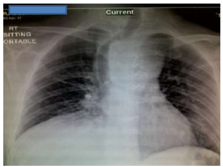
Fig 1: Chest X-ray with tracheal stent in situ