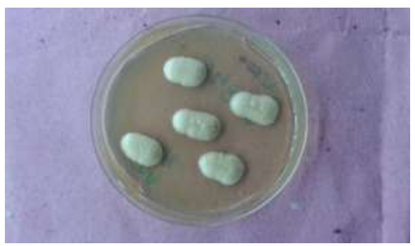
Fig.1: Colonies of Cryptococcus on Sabouraud Dextrose Agar, yeast-like highly mucoid, cream to buffed coloured colonies seen.