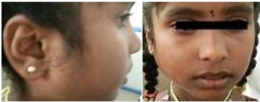
Fig-1: Swelling in the right parotid region below the ear

next 4 days along with a combination of Diclofenac 50 mg and Paracetamol 500 mg tid. Swelling as well as symptoms reduced significantly in three days (Fig.3). The child was asked to take plenty of fluids during such episodes and the parents were reassured that the symptoms might disappear as the child grew.