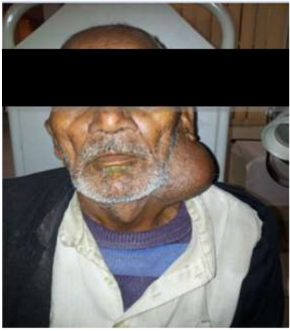
Fig. 1: Clinical Picture of Rare case