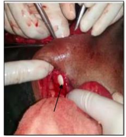
Fig-10: Defect in posterior wall