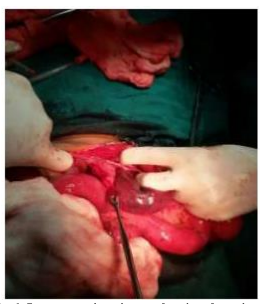
Fig-6: Intraoperative picture showing the point of twist that deliniates viable and strangulated part of meckels diverticulitis