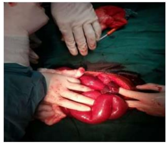
Fig-7: Intra operative picture showing excised meckels diverticulum attached to dome of urinary bladder