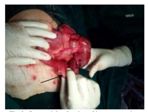
Fig-2: On partial reduction of intussusception buried Meckel's diverticulum with band was visualised