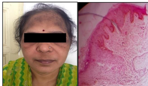
Fig-3: Clinical and Histopathological images showing Riehl's melanosis