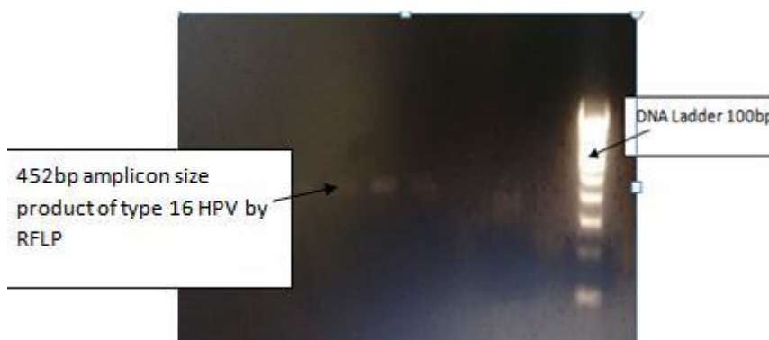
Fig 2: Agarose gel electrophoresis RFLP Picture Well 1- Restriction Enzyme A + Buffer A- Negative Well 2- Restriction Enzyme B + Buffer B -Negative Well 3- Restriction Enzyme C + Buffer C -Positive Well 4- Restriction Enzyme D + Buffer D/E -Negative Well 5- Restriction Enzyme E + Buffer D/E - Negative Well 6- DNA Ladder 100bp.