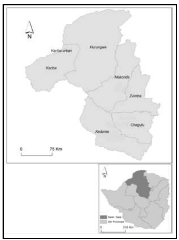
Fig.1: Administrative Districts of Mashonaland West province

Health service provision system manifests a high degree of inequality among the administrative districts. This can be attributed to various economic, physical, social and political factors. The administrative districts are used as spatial units of analyses for the examination of the pattern of health service provision in the province. The province is also within the largest water catchment in Zimbabwe, thus the Manyame basin.