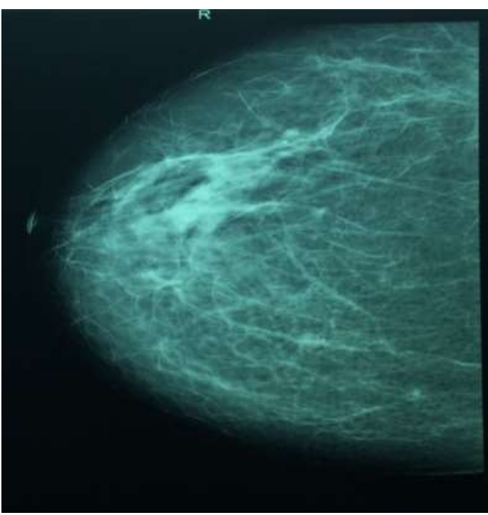
Fig-2: A hyper dense irregular lesion in the left breast