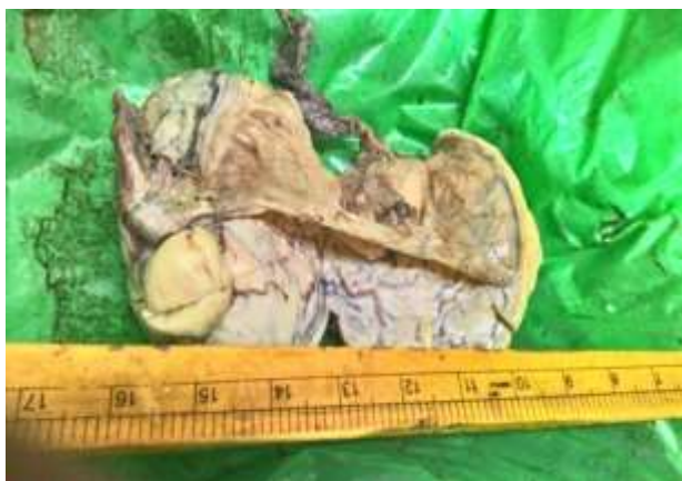
Fig. 3: showing gross appearance of testicular mass

The mass was excised and sent for histopathological examination. Gross examination revealed a 5x4x3 cm mass which was whitish in colour. Cut surface was solid and lobulated (Fig 3). H&E stained sections showed histopathological features suggestive of testicular seminoma.