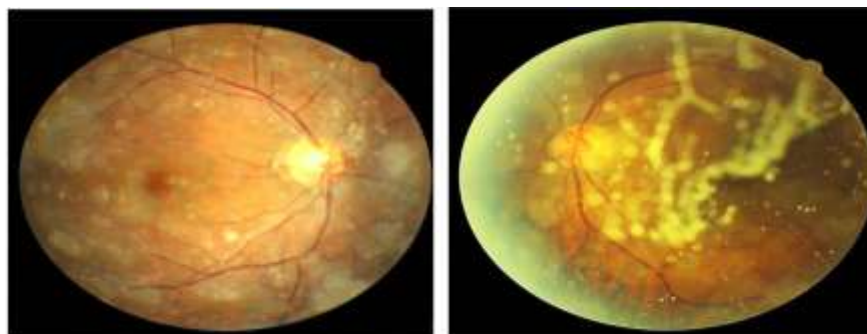
Fig 1: Asteroid hyalosis in this study

The overall prevalence of asteroid hyalosis was found to be 0.543% (31/7,856). Out of 31 patients with asteroid hyalosis, 24 were men (24/4,421; 0.543%), and seven were women (7/3,435; 0.204%). Among the 31 patients, 28 had unilateral and three had bilateral asteroid hyalosis (Figure 1-3).