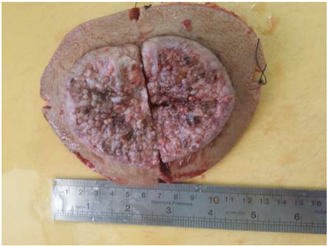
Fig 3: Gross of skin lesion