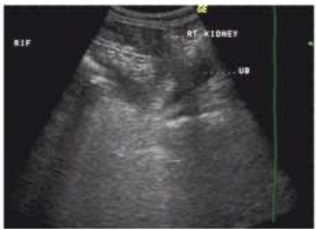
Fig. 12: Low lying kidney in RIF. US showing malrotated right kidney in RIF

In the non-GI non-GU pathologies lymphnodal masses were maximum which comprised of 26.6% of cases out of 15 nonGI nonGU pathologies followed by right psoas abscess in 13.3%cases (Table 4 and figure 13). In lymphnodal masses, out of 4 cases 3 were metastatic lesions and one was non Hodgkins lymphoma (figure 14). The metastatic lymphnodes showed their primary as melanocarcinoma right foot, post operated right seminoma testis and an occult primary respectively. Other two cases of non-GI non-GU pathologies in neoplastic variety were a single case