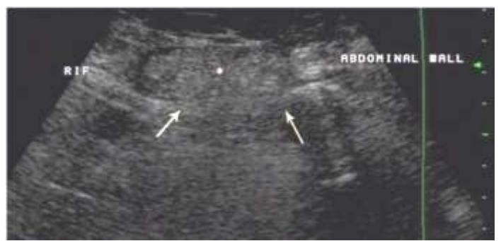
Fig 17: Incisional hernia in RIF. Hyper echoic contents of omentum herniating through a rent (arrows) in the abdominal wall in RIF.

The comparison of efficiency of USG and clinical assessment in correctly detecting the organ of origin in Gastrointestinal, Genitourinary and Non GI-Non GU