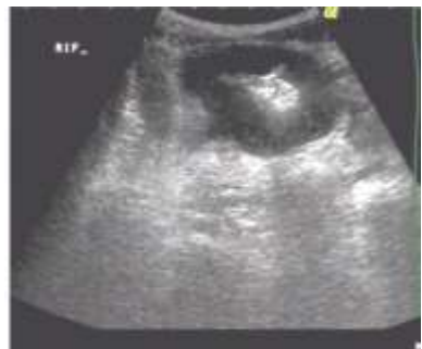
Fig. 3: Carcinoma Caecum in RIF. US showing circumferential wall thickening with target appearance of caecum.