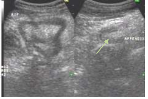
Fig. 4: Colitis. US showing mucosal and mural thickening of ascending colon in a case of infectious colitis suspected clinically as appendicular mass. Arrow showing normal appendix.