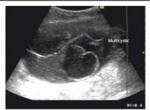
Fig 10: Benign ovarian mass. Multicystic benign ovarian cystadenoma extending to right iliac fossa.