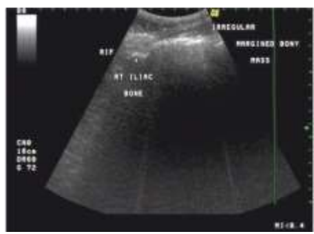
Fig 15:Chondrosarcomaright innominate bone. A bony mass is seen with posterior acoustic shadowing in continuity of right iliac bone obscuring the details of mass