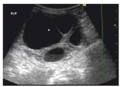
Fig. 16: Hydatid cyst in RIF. US shows well defined double walled multicystic lesion in RIF.