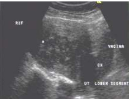
Fig.11: Posterolateral uterine fibroid. Longitudinal US showing well defined hypoechoic mass (asterisk) arising from right posterolateral surface of uterus extending to RIF