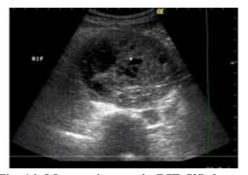
Fig. 14: Metastatic mass in RIF. US shows mixed echogenic mass with few necrotic areas within