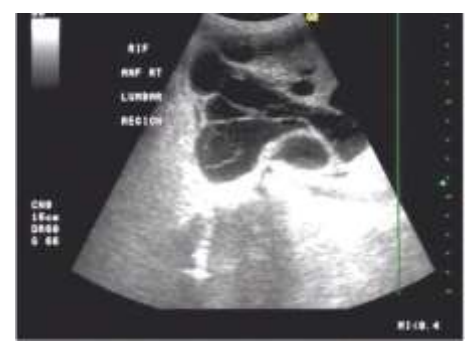
Fig. 8: Malignant right ovarian mass extending to RIF. Axial US show a mixed echogenic mass with internal septations and solid cystic components extending in right iliac fossa and right lumbar region.

iliac fossa (Figure 11). A single case of right adnexal ectopic pregnancy with loculated hematoma was seen extending in RIF. There were three cases of congential etiology which comprised of 1 left sided caudal crossed fused renal ectopy and 2 right ectopic iliac kidneys (Figure 12).