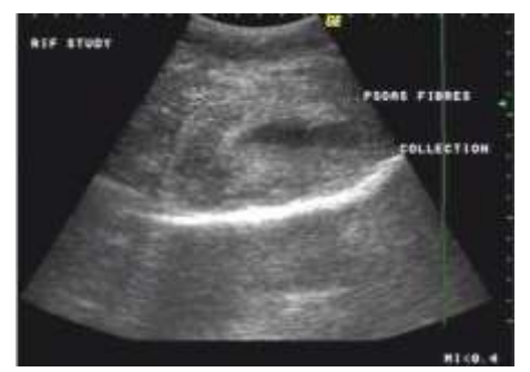
Fig. 13. Right psoas abscess. Longitudinal US shows well defined hypoechoic collection in right psoas muscle.

of retroperitoneal malignant spindle cell neoplastic mass and other was Chondrosarcoma of right innominate bone (Figure 15). CT was done in case of retroperitoneal mass which suggested that mass was a malignant retroperitoneal lesion. In case of chondrosarcoma of right innomiate bone, X ray and CT was done which showed bony mass involving right innomiate bone further proved on FNAC. There were one case each of hydatid cyst and incisional hernia (Figure 16 & 17).