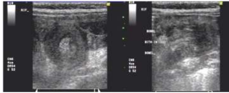
Fig. 6: Ileo colic intussuception. US show target and bowl in bowel appearance of intussuception on axial and longitudinal scans respectively.