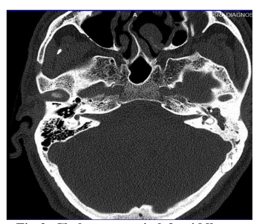
Fig-2: Cholesteatoma in left middle ear

Labyrinthine fistula was seen in 15% of patients with cholesteatoma. Out of this 12% were seen in Lateral semicircular canal and 3% in cochlear promontory.