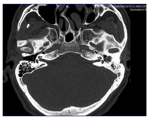
Fig-1: Erosion of bony ossicles with sclerosis of left mastoid air cells

intra-operatively. Thukral et al [5] in their study also found similar result. Tegmen erosion was seen in 12%.