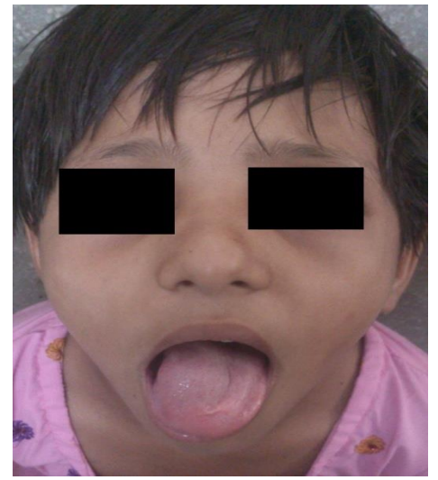
Fig 1: Patient presenting as lesion at tongue