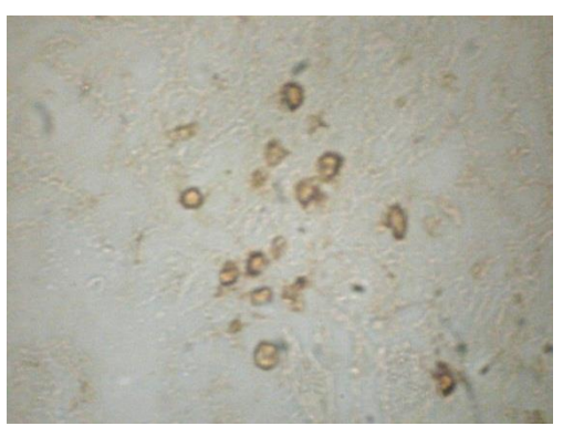
Fig 2: Photomicrograph showing LCA positivity of the small mononuclear cells (immüno staining by monoclonal antibody against LCA X 400).