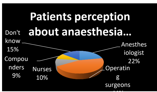
Fig-1: Patients perception of anaesthesia provider