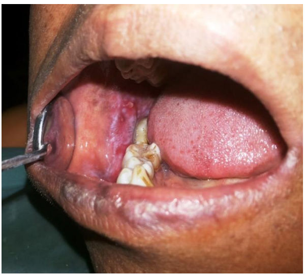
Fig. 1: Intraoral photograph of the patient showing posterior part of the right buccal mucosa affected with erosive type of lichen planus.