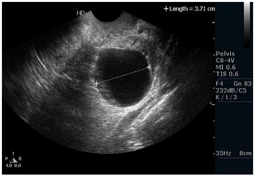
Fig-3: Functional ovarian cyst