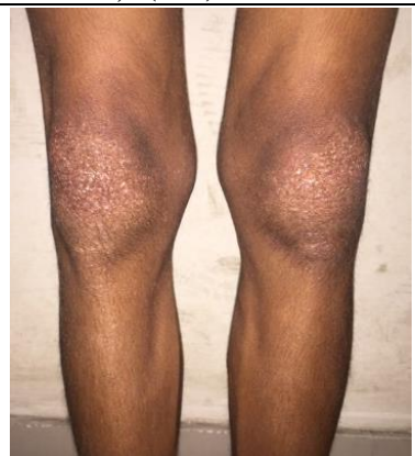
Fig-1-4: showing (left to right) heliotrope rash, atrophic papules and plaques (gottron's papules) over the dorsa of hands, back and the knees