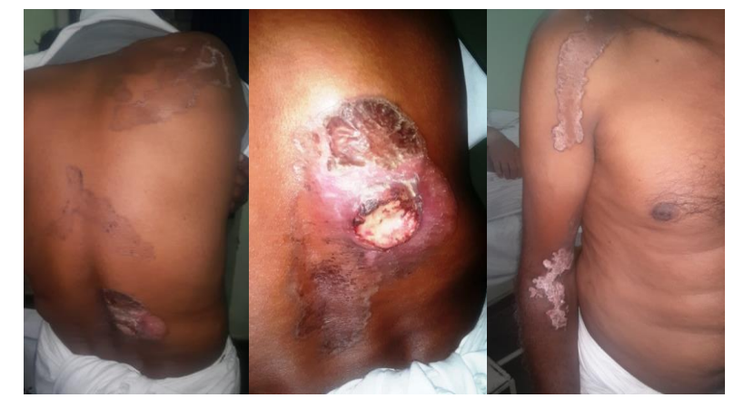
Fig 1, 2, 3: 55 years old male with porokeratosis and squamous cell carcinoma changes

A 55 year old male patient presents with multiple large round to oval 15 to 20 cm in size hyperkeratotic plaques, with atrophic centre and prominent border at right side of the back and right forearm since birth and having 5 to 7 cm large indurated ulcer with elevated margins since around 18 months.