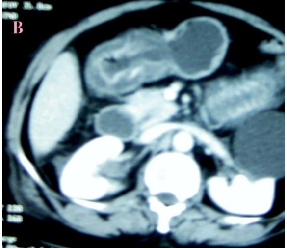
Fig-2: Computer tomography of abdomen showing small bowel loops with diffuse bowel wall hemorrhage and oedema.